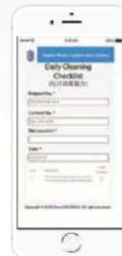
Cleansing Inspection Checklists