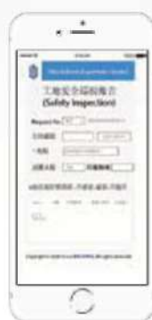
Site Safety Inspection Record