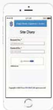
Site Diary/ Site Record Book