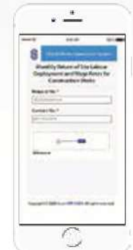
Labour Return Record