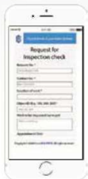
Request for Inspection/Survey